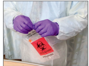
Figure 4. Handling the Nasopharyngeal Swab Specimen.

Shown is the swab in a collection tube placed in a biohazard bag.